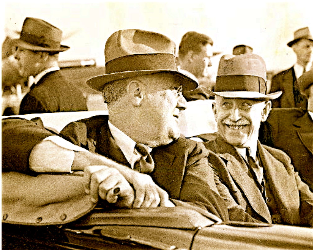
President Franklin Roosevelt, along with Orville Wright, during a visit to Wright Field on Oct. 12, 1940. FDR's motorcade went downtown to Courthouse Square where he addressed a crowd estimated at 100,000

The map shows that many of the 228 precincts without a candidate — shown in shades of blue — have a lot of Democrats. One question the party needs to address is why the suburbs, where many of Democrats live, there has been little effort or success in meaningfully organizing the local party. If you click the link on the bottom right of the map, you can view full-size in your browser.